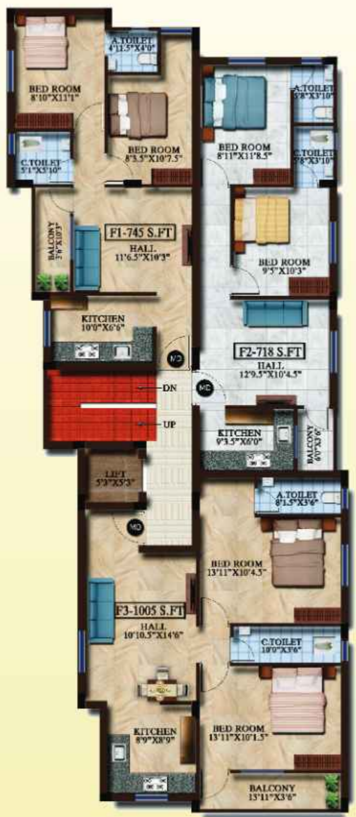
First Floor & Second Floor Plan