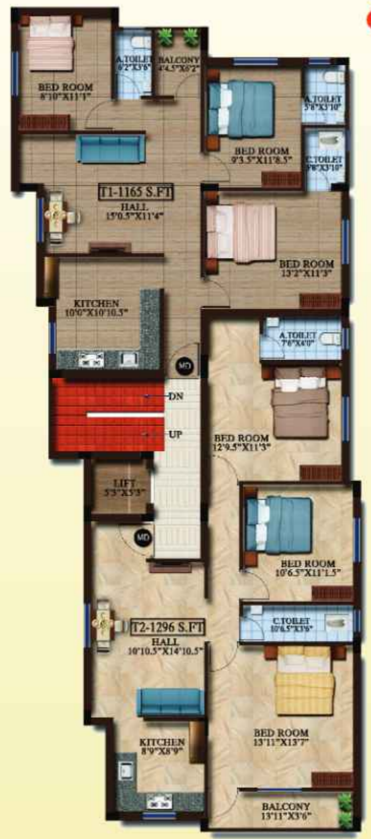
Third Floor Plan